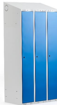
Clothes locker, sloping roof