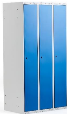
Clothes locker, flat roof

This EPD applies to AJ Products clothes locker Classic, 3-section. High-quality clothes lockers with a welded steel frame, power coated with blue, grey or black doors. The 3-sections are available with sloping or flat roof also as a combo locker with two doors for one person with sloping roof. These lockers are highly adaptable to pair with other sizes and combinations to fit your needs and preferences. The steel-plate lockers are perfect for storing clothes and personal belongings in workplaces, gyms, schools, exhibition rooms and other public areas.