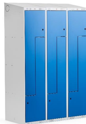
Clothes Z-locker, sloping roof