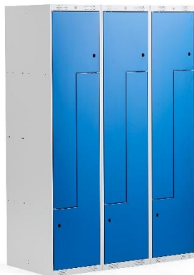
Clothes Z-locker, flat roof

This EPD applies to AJ Products clothes Z-locker, 3-section. High-quality clothes lockers with a welded steel frame, power coated with blue, grey or black doors. The 3-sections are available with sloping or flat roof also as a combo locker with two doors for one person with sloping roof. These lockers are highly adaptable to pair with other sizes and combinations to fit your needs and preferences. The steel-plate lockers are perfect for storing clothes and personal belongings in workplaces, gyms, schools, exhibition rooms and other public areas.