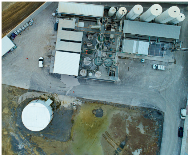
→ Cosentino® water treatment and recovery plant